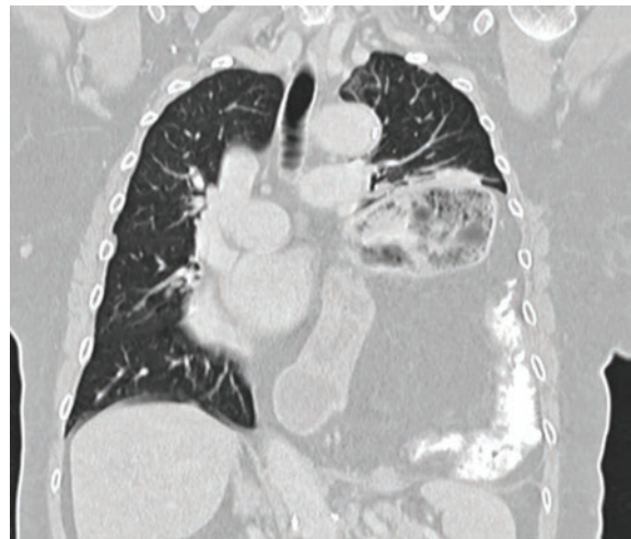
Figure 1. Thoracoabdominal computed tomography image. This pulmonary image reveals the type IV paraesophageal hernia.

At first, the usual laparoscopic approach hernial defect correction was successfully performed, reducing the transverse colon and the greater omentum in the abdominal cavity. However, reduction of the proximal stomach was not possible due to chronic strangulation and a shortened esophagus. The esophagus was poorly visualized forcing a medial supraumbilical